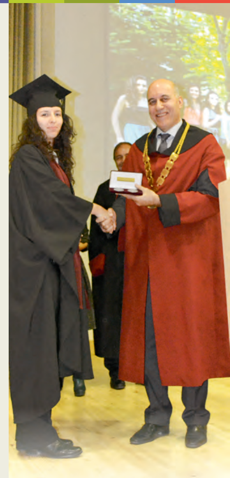
Graduation ceremony of University of Economics -Varna