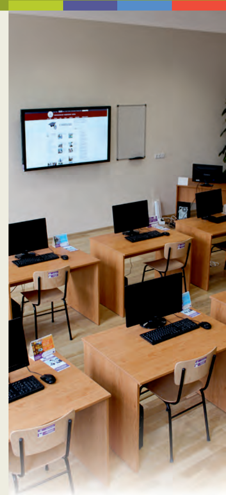
Lecture hall of the University of Economics - Varna