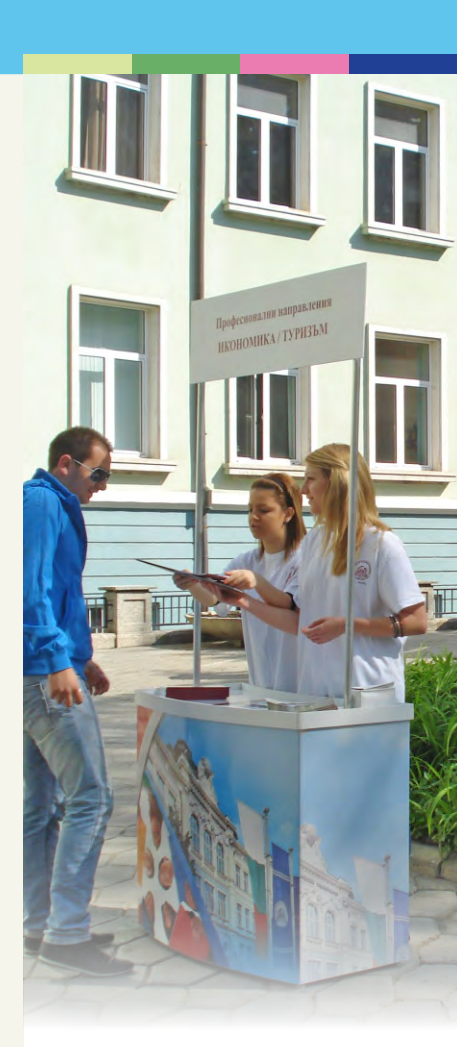
Open Days at University of Economics - Varna

Bulgarian language Foreign language - English Foreign language - French Foreign language - German Foreign language - Russian