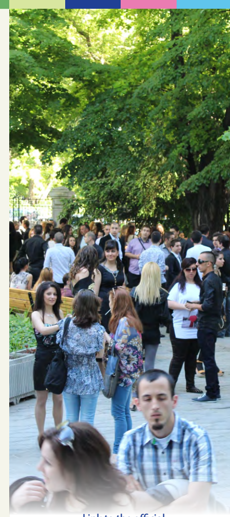
Link to the official website of the UE - Varna www.ue-varna.bg

Upon completion of the bachelor's degree in the area of international business students can continue their education in the educational and qualification degree "Master" in this country or abroad.