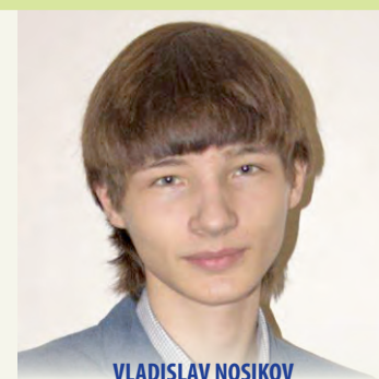
Age 16, from Moscow

I decided to continue my education in the University of Economics in Varna, because it aives me a lot of opportunities for my future, like: aet in touch with prospective employer and have a good job. Nowadays, people who are learning such courses as an International Rusiness are one of the most needed people in the world, because everything revolves around business. It is very interestina for me to learn how the world economy works. Education in the University also gives me some great skills, like solving difficult problems, not to give up in case of failure. Speaking about lectures, I'd like to say that they are really fascinating and interesting, because we can learn more and more from each lecture in aeometrical progression, so that we will be able to work more efficient in future. Of course the best thing about these lectures that they are in English, so we can improve our language skills. That's why I've chosen this program.