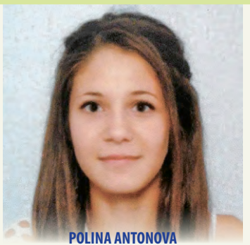
Age 19, from Razgrad

I decided to continue my education in the University of Economics in Varna, because it aives me a lot of opportunities for my future, like: aet in touch with prospective employer and have a good job. Nowadays, people who are learning such courses as an International Rusiness are one of the most needed people in the world, because everything revolves around business. It is very interestina for me to learn how the world economy works. Education in the University also gives me some great skills, like solving difficult problems, not to give up in case of failure. Speaking about lectures, I'd like to say that they are really fascinating and interesting, because we can learn more and more from each lecture in aeometrical progression, so that we will be able to work more efficient in future. Of course the best thing about these lectures that they are in English, so we can improve our language skills. That's why I've chosen this program.