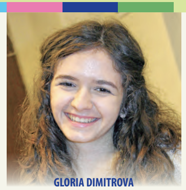
Age 18, from Vidin