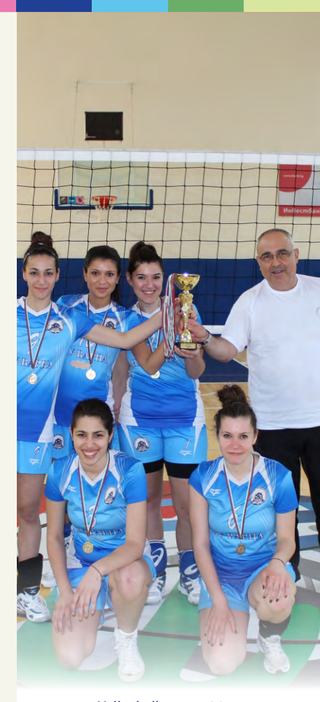
Volleyball competition at University of Economics - Varna

Document attesting to the right of the applicant to be trained in the degree they are applying for in their own country.