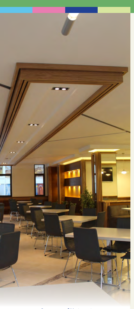
Canteen of University of Economics - Varna