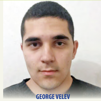
Age 19, from Pleven

I am currently a first year student in the programme 'International Business,' for which I learnt about from the site of the university. I chose this programme, because not only do you get prepared in English at a higher level, but you also learn a lot more about economics. I believe that it will help me in making a professional career in the business industry. One of the best things about the programme is communicating with the colleages and working toaether.